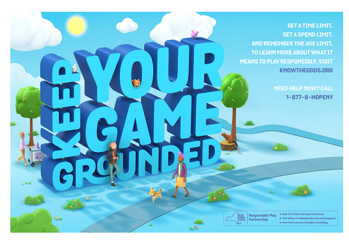
2021 Campaign Poster

While advocacy campaigns like this one cannot match the value of actual gambling prevention, treatment, and recovery programming, they do reduce the need for such expenditures by the New York Council on Problem Gambling and OASAS, freeing them to fund other worthy endeavors.